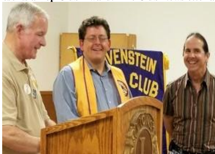
DG Les Mize and new Club Officers