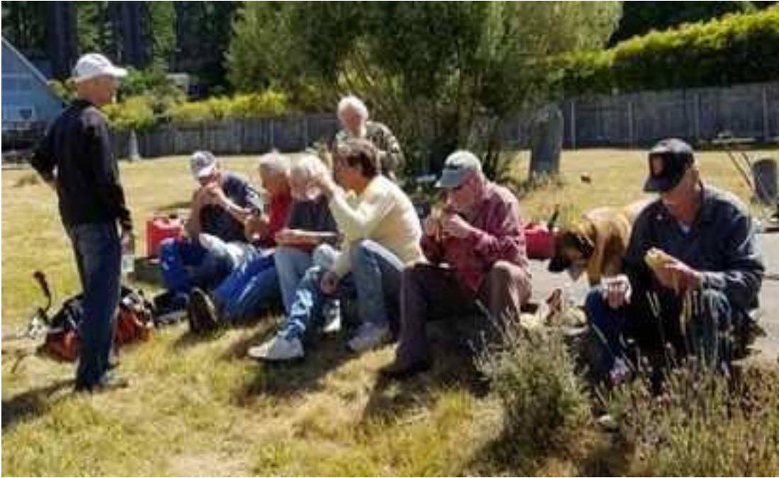
The Anchor Bay Cemetery cleanup crew finally gets their well-deserved lunch break.