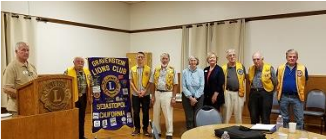
DG Les Mize and new Club Officers