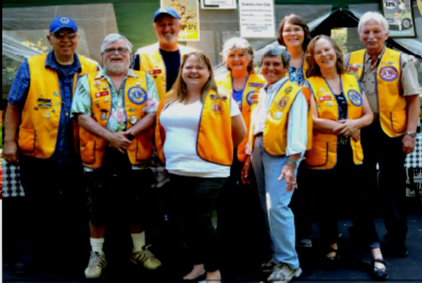
The Art in The Redwoods beverage booth was attacked by a pride of happy Lions!